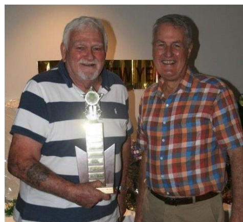
ORCHID OF THE YEAR Perpetual Trophy