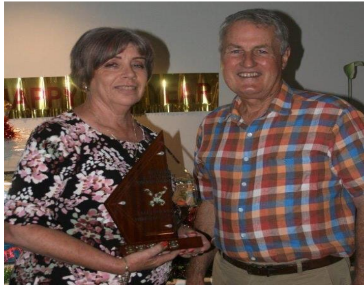
Marj Purnell Trophy – Best Ceretobe at AGM