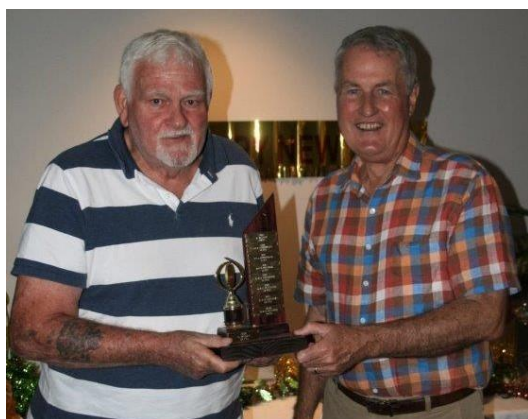
JUDGES CHOICE (A.O.C. Trophy)