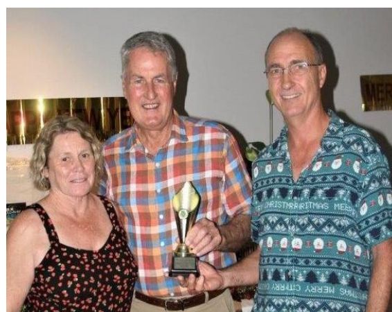
NOVICE (MDOS Trophy)