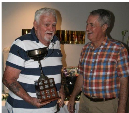
OVERALL POINTS (Arthur Ladbrook Memorial Trophy)