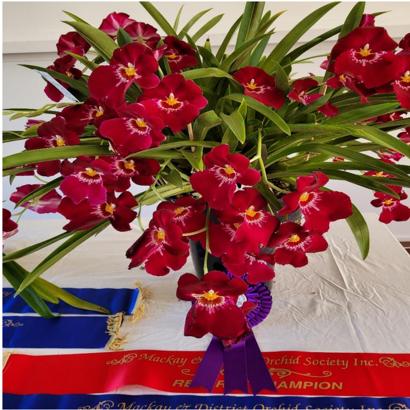
Milt. Bert Fields 'Leash'