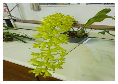
Gram. scriptum 'citrinum' M. Trindorfer