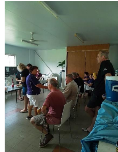
A quick catch-up after the Autumn Show.