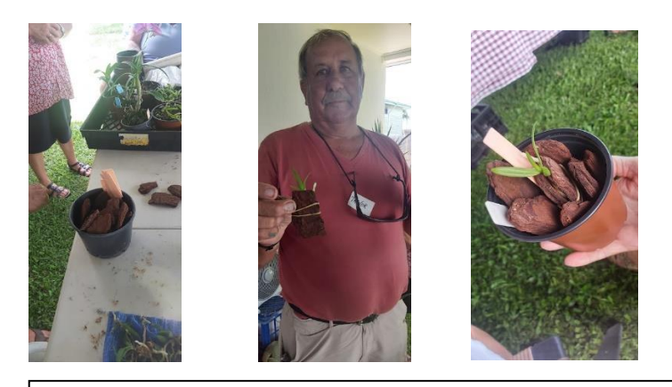
Downside is this method is they require regular watering.