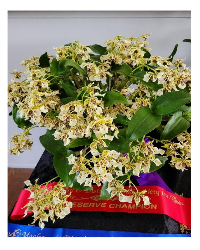
RESERVE CHAMPION/CHAMPION SPECIMEN