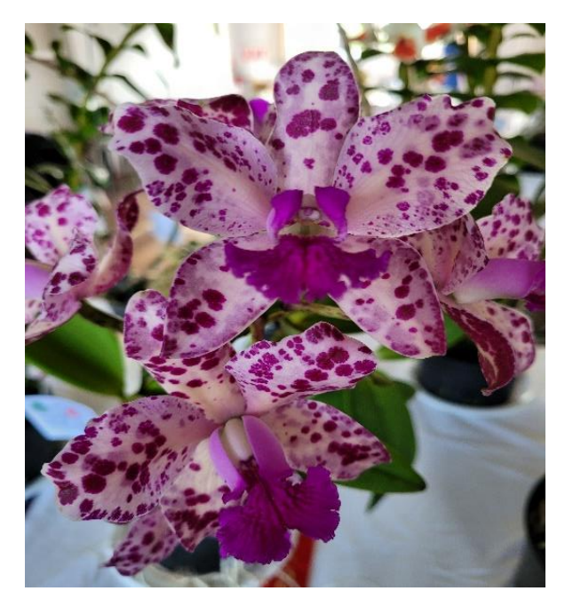
RESERVE CHAMPION NOVICE