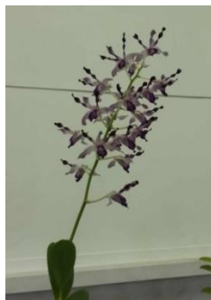
Den. Impact Twister