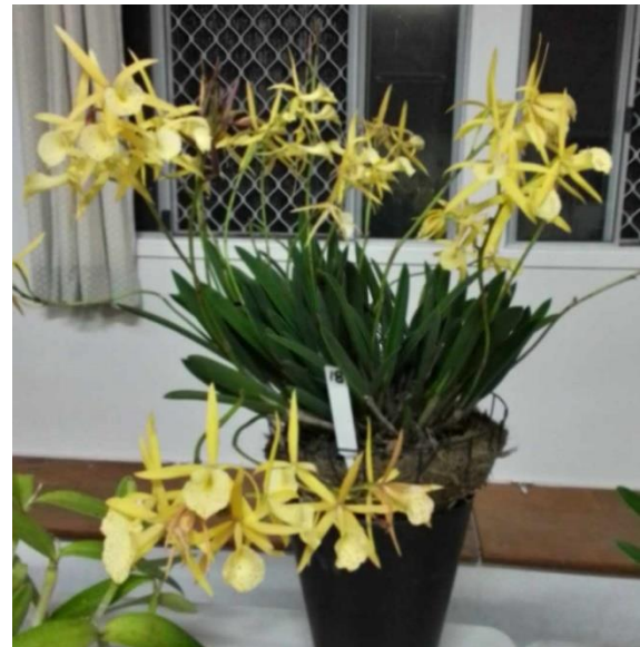
Bc. Yellow Bird T. & L. Coburn